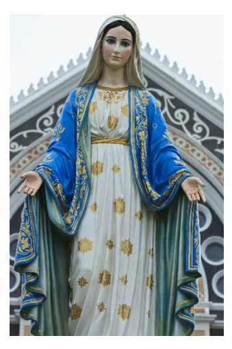
Our Lady of Grace

people who are committing horrendous sins, outrages and sacrileges, to have mercy when they come to eternity. Oh, Mother Mary, her time is to be always working, appearing all over the world to her visionaries and [attending] to the needs of her children. Oh, my